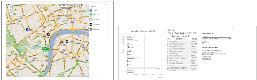
Fig. 2. (a) Map view for recommended items. (b) Example of statistical (SCOVO) interactive widget for public sector info, such as mortality rates, unemployment etc.

In addition to these items, dayta.me also recommends he review statistics pertaining to the conference’s location, including crime rates in the area over recent years, and weather and temperature forecasts for the day in question. These are slices of government data sets (from data.gov(.uk) ) and summaries of real-time data sources 1 that are selected and rendered into easy-to-read charts. He is dismayed to discover that certain areas near the conference have particularly high crime (Figure 2b). As the conference ends late, he decides to look for nearby hotels so he will not have to walk far.