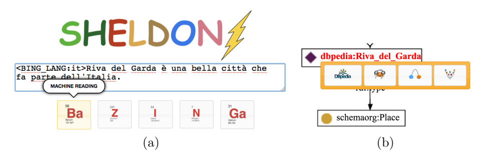
Fig. 1: SHELDON front page (a), SHELDON's navigation toolbar for identified DBpedia entities(b)

Fig. 1(a) shows the main interface of SHELDON where one can type a sentence in any language and decide which semantic task to perform. The reader will notice that SHELDON will always provide the results in English. The Bing Translation APIs<sup>9</sup> have been used and embedded within SHELDON.