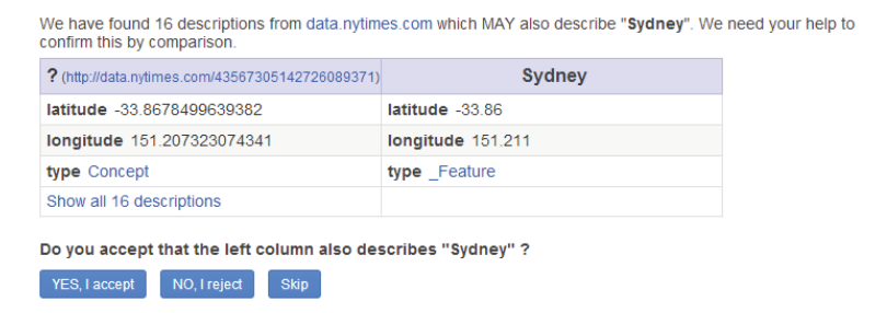
Fig. 3. Verifying candidate coreferent URIs based on a comparative summary.

will be self-motivated to contribute. More communities are to be identified in the future.