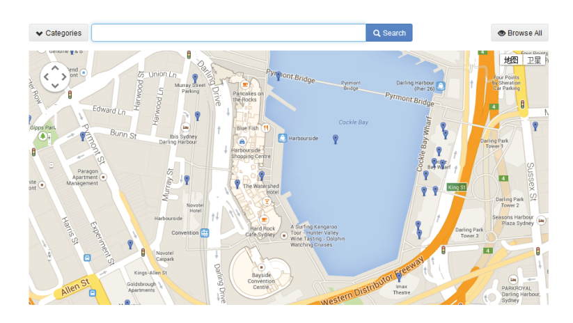
Fig. 1. A map view with POIs.

SView conducts pay-as-you-go data fusion. Users are given incentives for collaboratively verifying candidate coreferent URIs computed by the system, and the process is facilitated by comparative entity summaries.